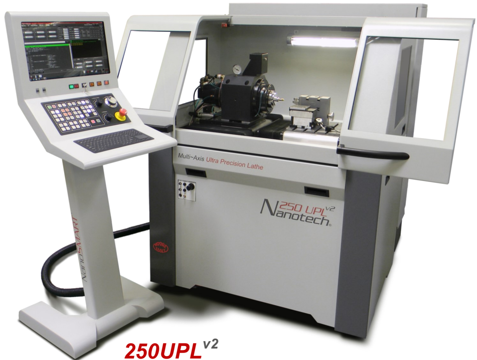
250UPL v2 Compact Diamond Turning Lathe

Launch of 400UJG v1 at JIMTOF November 2016, Tokyo, Japan