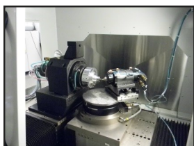
Oil Hydrostatic B-axis