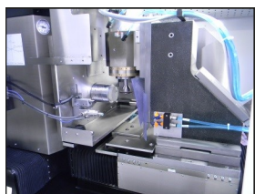
HD Vertical Grinding Spindle