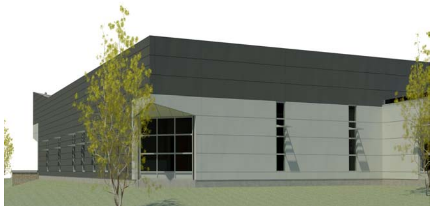
Architectural Rendition of New Nanotech Facility

The project is testimony to the success of Nanotech to date and its commitment to future growth. Completion of the new facility is scheduled for the Summer/Fall period of 2009.